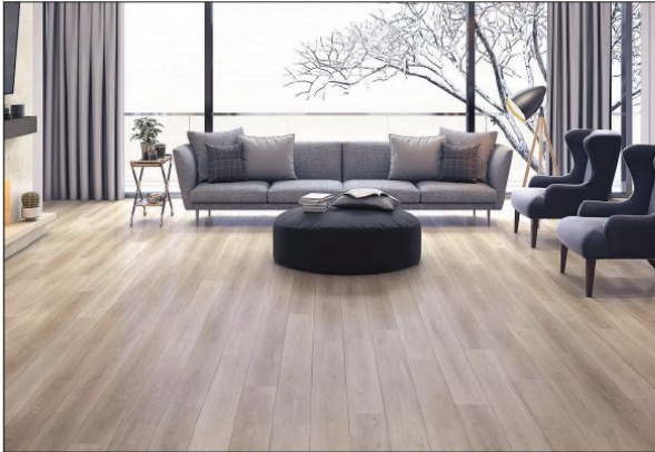
Torlys' Rigidwood Firm Elite SPC in Merle.

Lastly, Torlys updated the color offering on its Corkwood line, which is two years old, and added the XP finish to that line, as well.